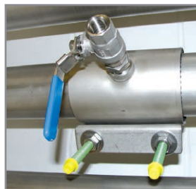
B Spot drilling collars