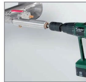
Drill under pressure with the CS drilling jig

3) Due to the large measuring range of the probe even extreme requirements to the consumption measurement (high volume flow in small pipe diameters) can be met.