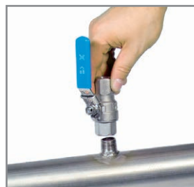
A Screw neck

Drill holes can be drilled through the 1/2" ball valve into the existing tubing with the help of the drilling device, the drill chips are collected in a filter, then the probe is installed as described under 1).