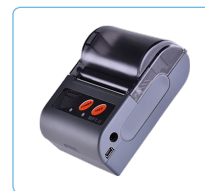
Wireless Bluetooth Printer (EE900P)