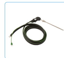
Sampling Probe (E85AACSF13)